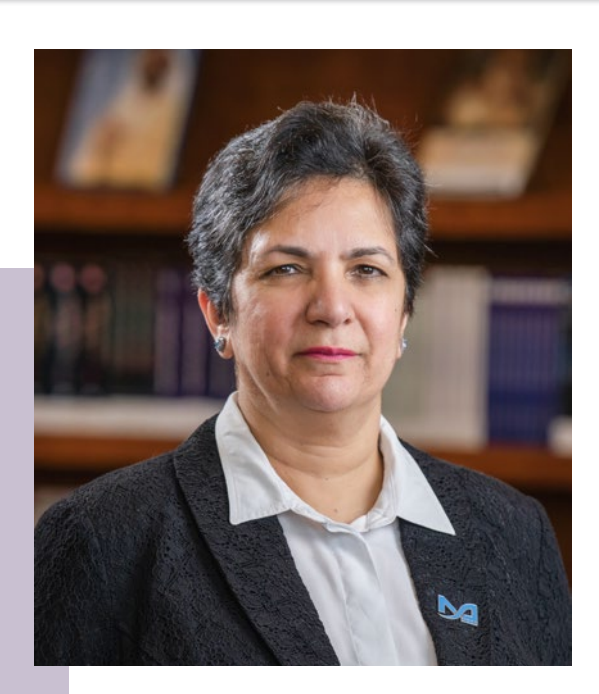
About the author: