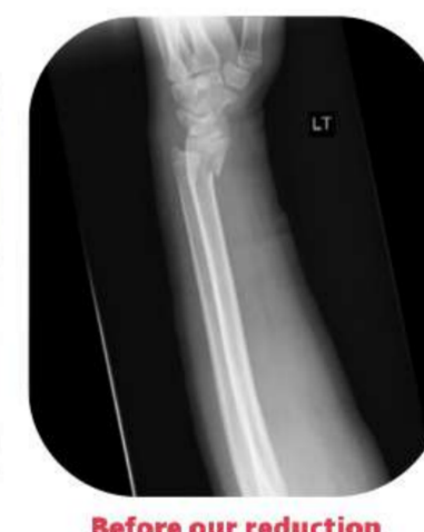
Before our reduction