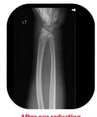
After our reduction